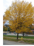
C. Princeton Elm Variety: Shade Cost: $1,500 # Available: 6