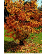
I. Witch Hazel Variety: Ornamental Cost: $1,000 # Available: 4