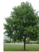
D. Swamp White Oak Variety: Shade Cost: $1,500 # Available: 3