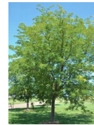
E. Shadowmaster Honeylocust Variety: Shade Cost: $1,500 # Available: 1