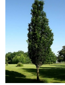
B. Regal Prince Oak Variety: Shade Cost: $1,500 # Available: 7