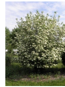
F. Blackhaw Viburnum Variety: Shrub Cost: $500 # Available: 1