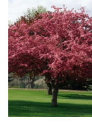
G. Cardinal Crabapple Variety: Ornamental Cost: $1,000 # Available: 3