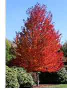
A. Redpointe Maple Variety: Shade Cost: $2,500 # Available: 7